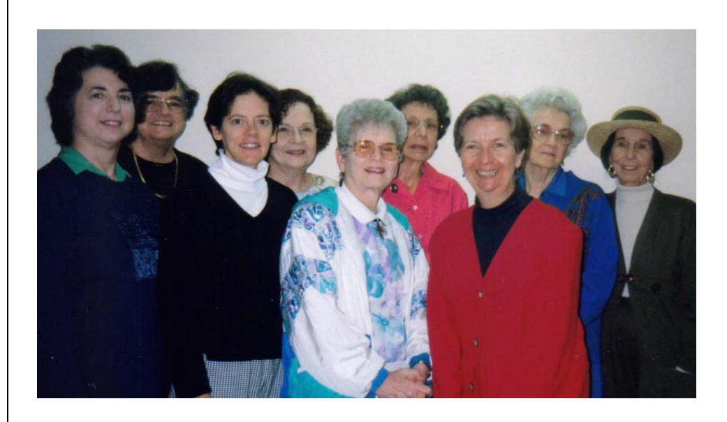
Participants in a 1997 ERA retreat.

As part of FaithWorks, in partnership with Habitat for Humanity, the Council has helped build more than 50 homes in rural North Carolina, including this one under construction in 2004.